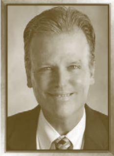
Mayor Jeff Nelson